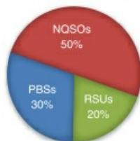
Current Ulta Beauty Annual LTIP Award Mix